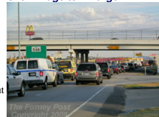
Traffic is diverted off of Highway 80 at Pinson Rd., in front of Dairy Queen at 4:15 p.m.